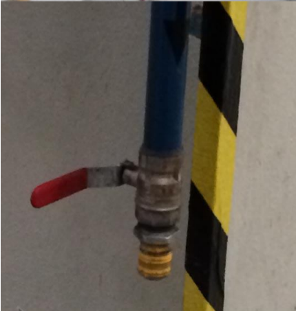
compressed air distribution