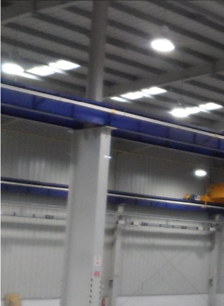
fire water distribution